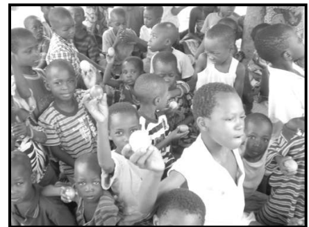
Kid's Club Easter Celebration

For the latest news visit our blogs at www.cox-net.com . As always the best way to reach us is via email: family@cox-net.com . Alternatively you can try 214 764 3929 and leave a message (some times you can even talk to us so do not forget the time difference. Benin is +1 GMT/UTC.